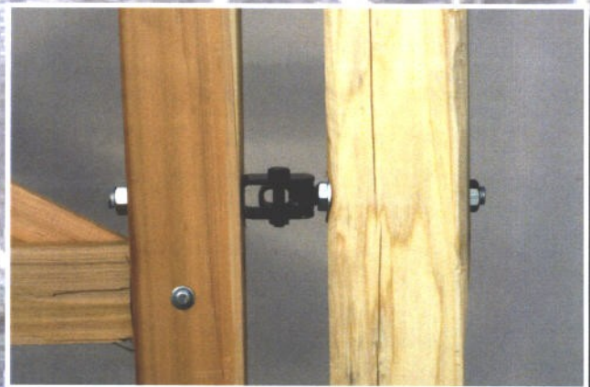
5/8 AND 3/4 INCH ALL THREAD HINGES