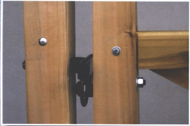
STANDARD DOUBLE RING LATCH

We now offer Made in Montana HAMILTON HINGES and LATCHES for use on all our cedar gates