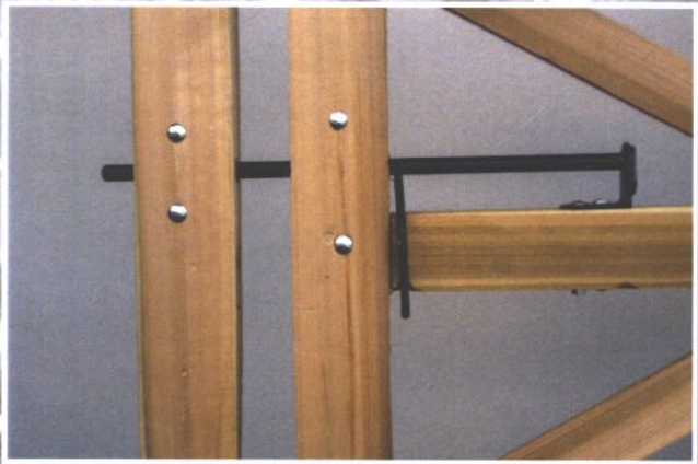
SLIDE LATCH FOR SINGLE OR DOUBLE GATES